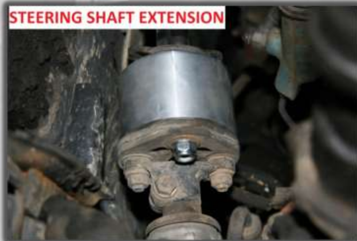
Two inch shown in picture