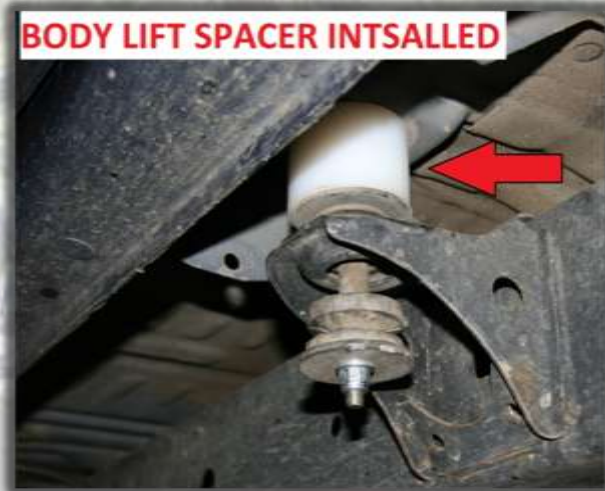
Two inch shown in picture